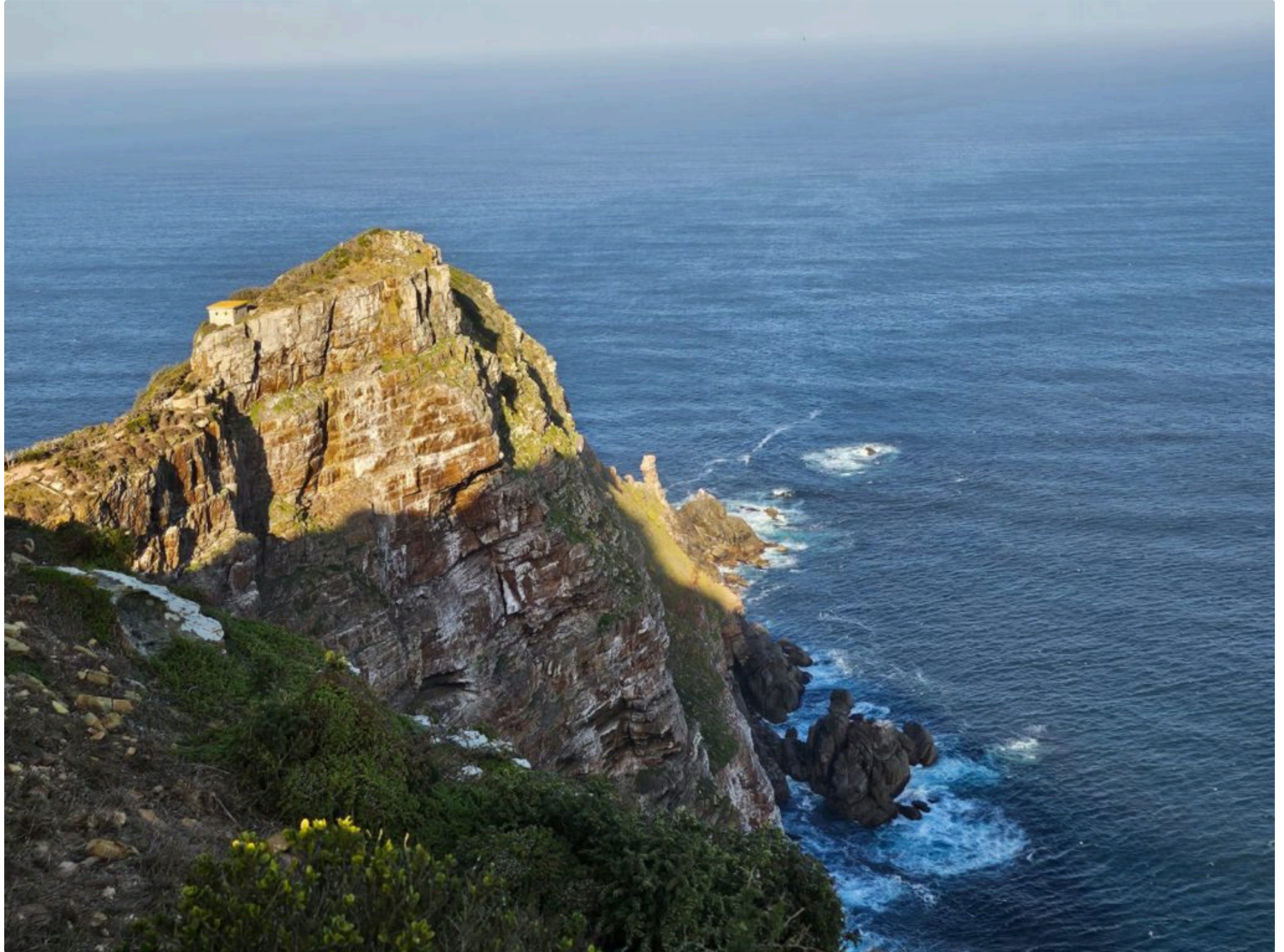
🖼 Cape Town